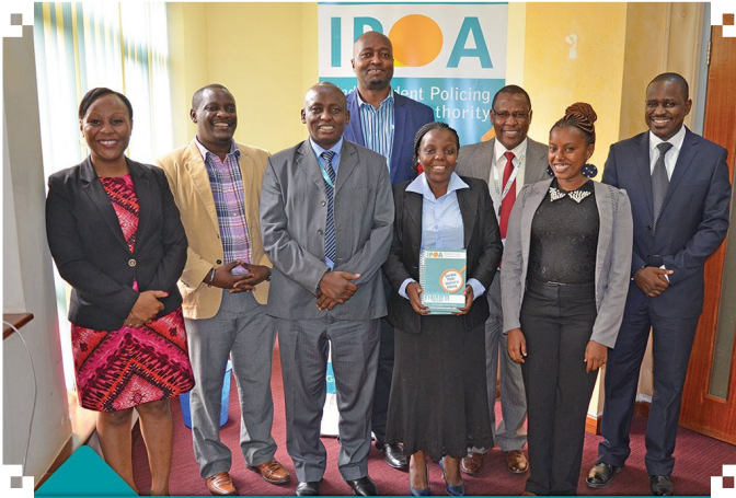
Tanzania's Legal and Human Rights Centre officials and the Kenya National Commission on Human Rights visited IPOA offices on 13/3/18