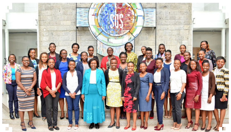
IPOA outreach with women attending the Women Leadership Programme at the Strathmore Business School 12/4/18