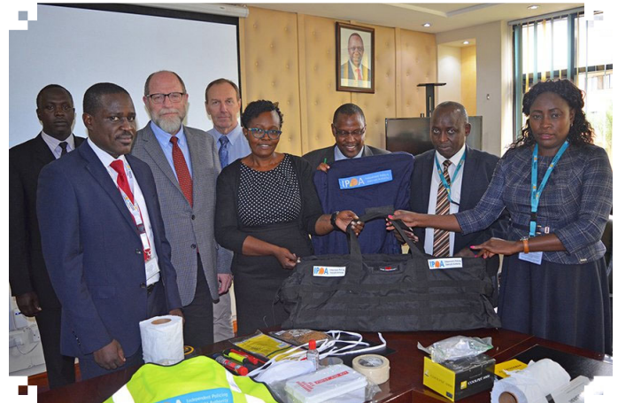
US Embassy officials present investigation equipment to representatives of the IPOA management for the recently opened regional IPOA offices 9/5/18