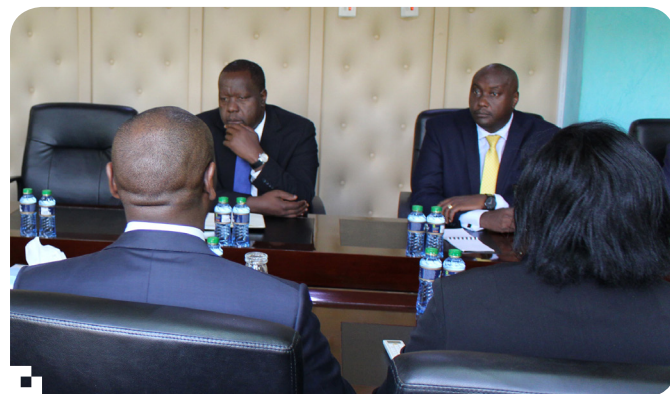
CS Interior, Dr Fred Matiang'i holds discussions with the IPOA Board