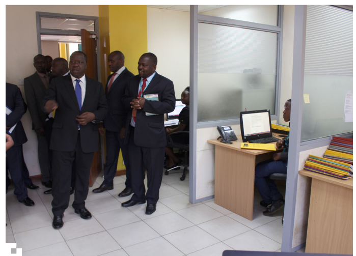
Below: CS Interior, Dr Fred Matiang'i encourages complaints management officers and commends them for their good work