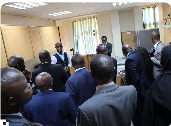
CS Interior, Dr Fred Matiang'i visits the IPOA forensic lab