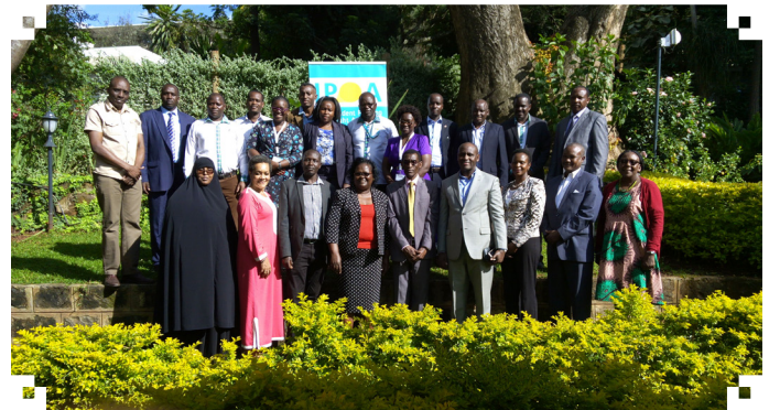
IPOA Board members and the IPOA management during the Board farewell luncheon with staff at the Panafric Sarova Hotel 18/5/18