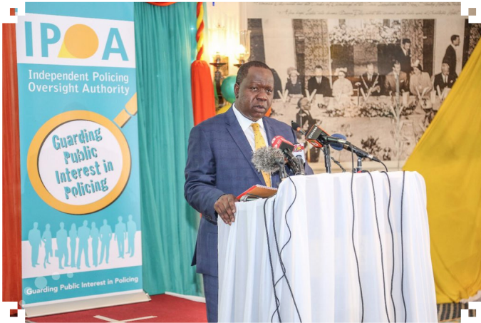
CS Interior, Dr Fred Matiang'i addresses guests at the End of Term Occasion

The Cabinet Secretary for Interior commended the IPOA Board for doing a fantastic job. The President of the Republic of Kenya, his Excellency Uhuru Kenyatta expressed gratitude to the Board for doing a commendable job. He was sincerely satisfied with their work as a board. He assured the board that IPOA would remain independent and a new board would be recruited soon.